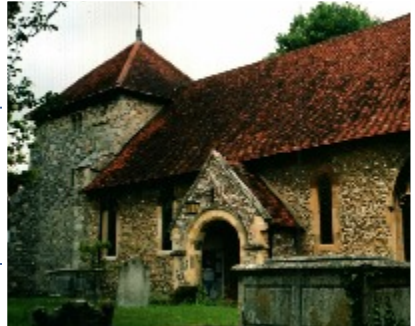
St Bartholomew's Church