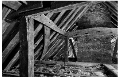
Roof at Old Hyde House (Mike Caldwell)

Numbers limited to 25. Early booking strongly recommended. No charge.